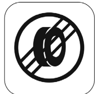
End of Tyre Marking/Checking