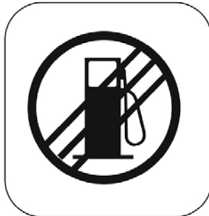
End of Refuel Zone