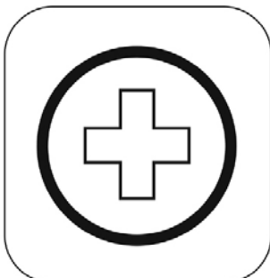
Medical Vehicle Point

Colour of Control Area Entry: YELLOW Colour of Control: BLUE