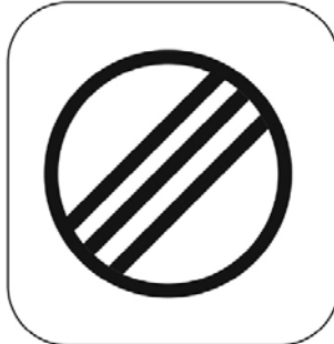
End of Control Area