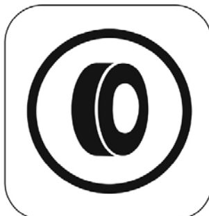
Begin of Tyre Marking/Checking

Colour of Control Area Entry: YELLOW Colour of Control: BLUE