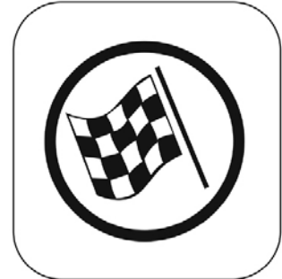
Flying Finish Line

Colour of Control Area Entry: YELLOW Colour of Control: RED