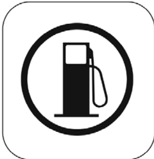
Begin of Refuel Zone

Colour of Control Area Entry: YELLOW Colour of Control: RED